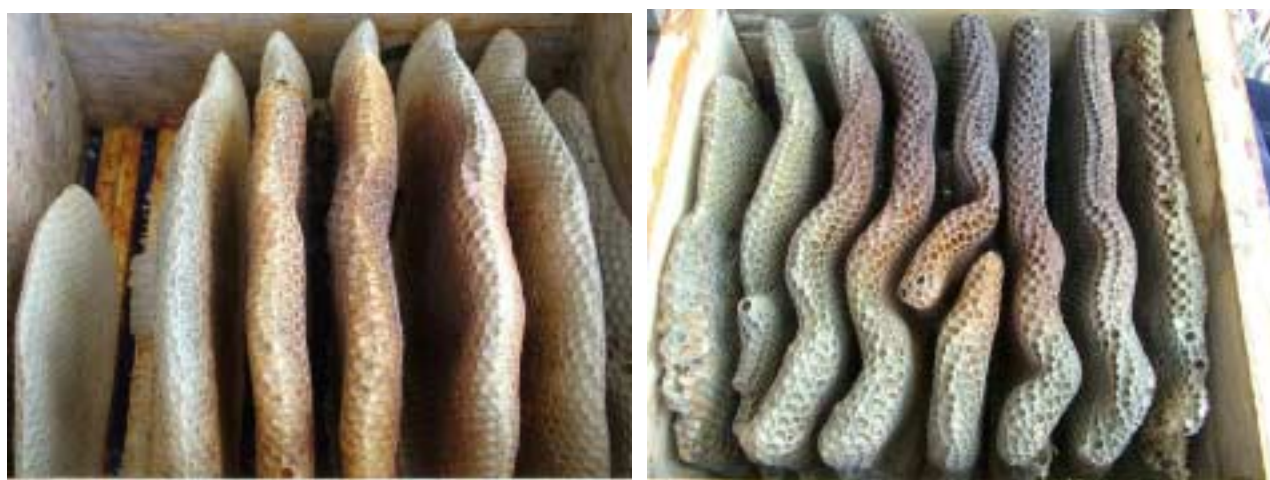
Figures 11 & 12. Natural comb in Warré hives viewed from below. Left: box only two-thirds completed (one broken comb); Right: filled box with some combs crossing to adjacent bars despite use of wax starter-beads on top-bars.

Most beekeepers will find it impractical to let the bees build entirely natural comb, for example by using, instead of frames, a perforated board or even top-bars without starter strips. Aside from the constraints of the cavity size and shape, the comb produced in this way has its architecture entirely determined by the bees, including comb spacing, cell size distribution and undulations. Beekeepers usually prefer to guide the bees' comb building to some extent. This can range from plain top-bars to top bars with a beading of wax along their undersides as starter (see Figs. 11 & 12), to top-bars with starter-strips of foundation, to frames with starter-strips of foundation, to frames filled with wired foundation.