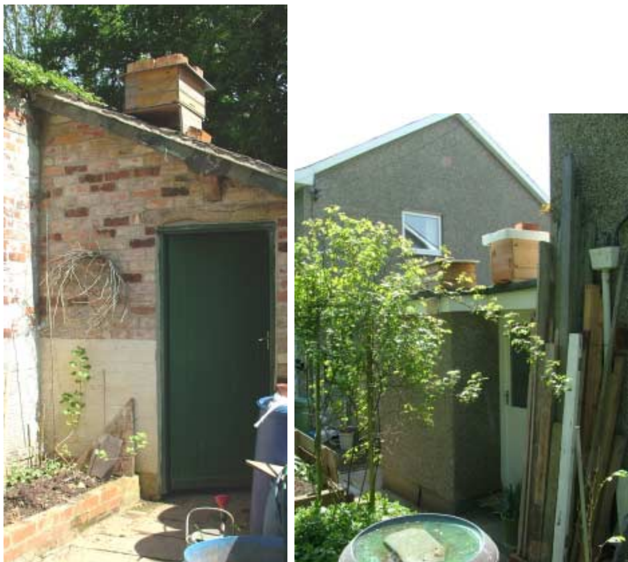
Figures 13 & 14. Bait hives: (left) made of recycled tongue-and-groove timber prominently sited on the roof of a garden shed ; (right) two Warré boxes in use as a bait hive with another bait hive of recycled timber to their left.

An empty element at the bottom of the colony also allows disturbance during feeding to be minimised. A container of feed can be placed on the floor. No heat is let out of the brood nest. Indeed, the colony appears rarely to notice the intrusion.