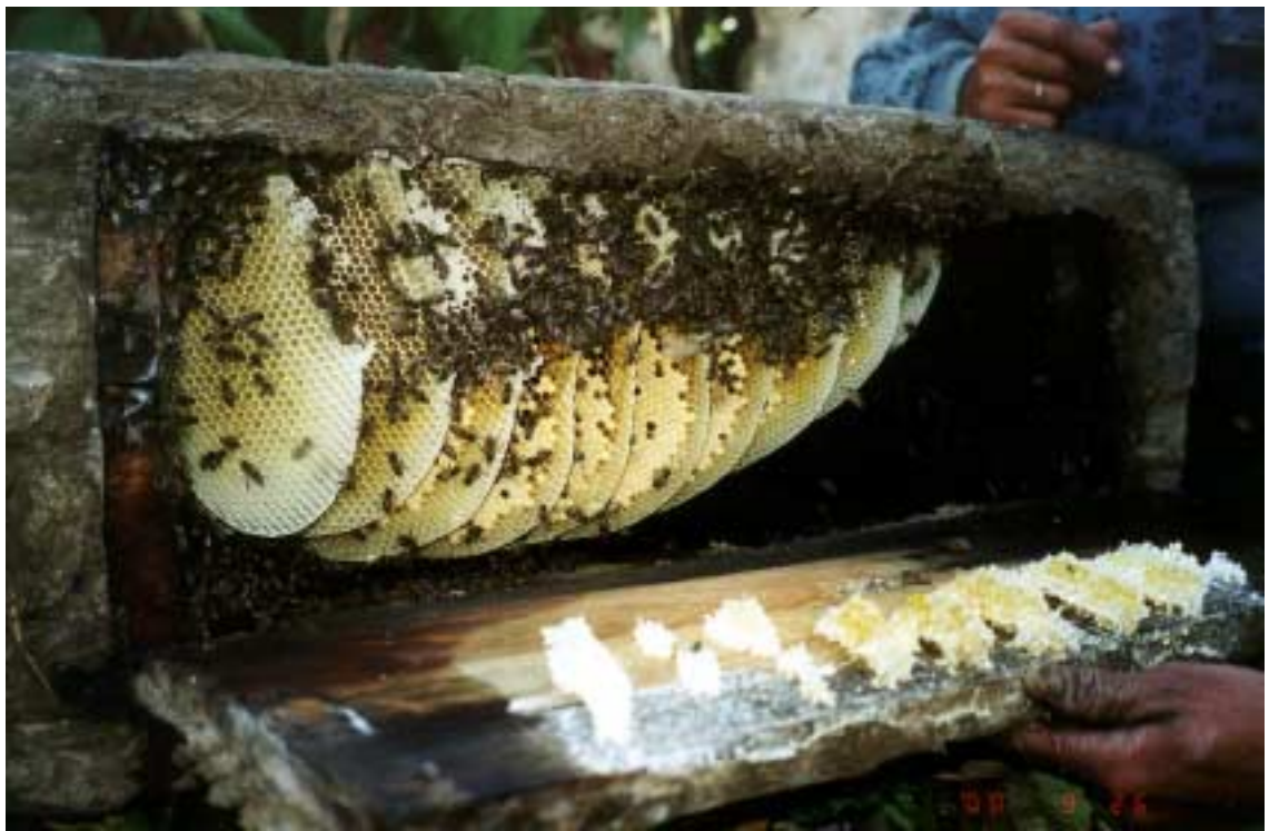
Figure 9. Colony in side-access log hive, Jumla, Nepal.