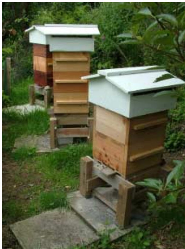
Figure 16. Garden apiary of three Warré hives

Let us encourage extensive, i.e. low-intensity, beekeeping carried out by a larger population of beekeepers and made possible by much simpler equipment that requires far less intervention. 'Small is beautiful'. Top-bar hives, especially that of Warré, make an increase in small-scale beekeeping a real possibility.