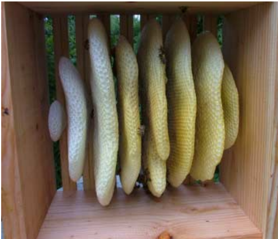
Figure 17. New natural comb in a Warré hive box

If chemicals have to be used just to keep colonies alive while co-adaptation is taking place then it needs to be part of integrated pest management, i.e. monitoring Varroa burdens and treating only when absolutely necessary and at the most appropriate time. The organic acids are preferable for their documented low residues. Essential oils, such as thymol, are less acceptable because of their absorption into wax. But any intervention just further postpones the achievement of co-adaptation. European beekeeping has not yet had to deal with the challenge of small hive beetle (SHB). It appears that strong colonies with no crannies to hide in will cope with the SHB challenge. Top-bar hives with their natural comb may prove well suited to this.