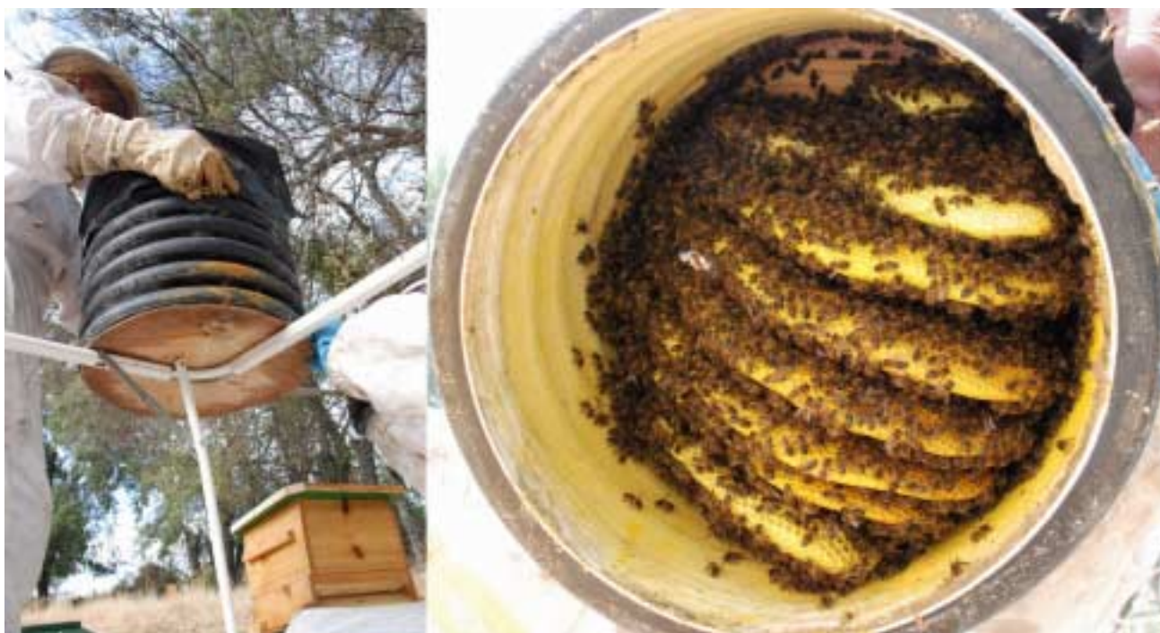
Figure 21. Drainpipe bait hive

It is not always practicable or safe to take a swarm, for instance if it is high in a tree. So in order to minimise losses of swarms, some inexpensive bait hives can be distributed in the vicinity of the apiary and inspected frequently. Ideally the hives should be in an elevated prominent position at about 3 m from the ground, 300 m or more from the apiary, have a volume of about 40 litres and an entrance size of about 12 square centimetres 54 . It should also smell of bees. This can be achieved by coating the inside with beeswax and the entrance area with propolis. Bait hives have been made from all sorts of containers. An ingenious solution involving a piece of drainage pipe from which the swarm can be simply lifted and transferred to a Warré hive is shown in Figure 21.