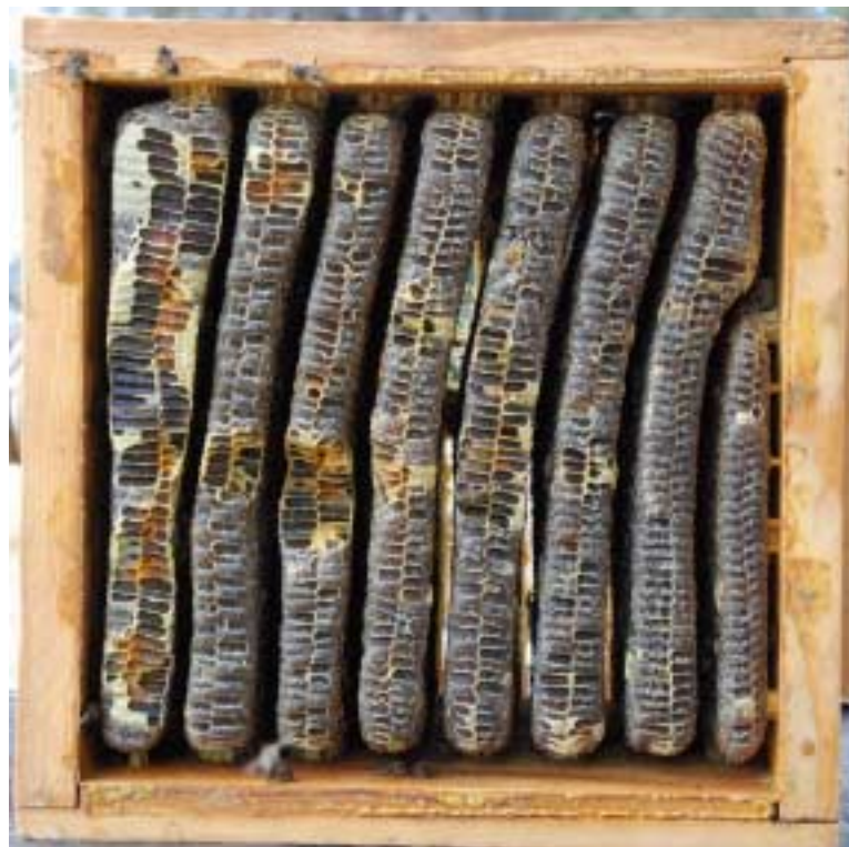
Figure 19. Honey harvest from a Warré hive

No bee escapes, blowers, fume boards, fumes, extra supers, uncapping knives, extractors or bottling tanks are needed when harvesting honey from a top-bar hive. With the horizontal format, bees are simply brushed off the combs and the comb cut into a bucket with a lid. With the Warré hive the bees in the topmost box are smoked into the one below with natural smoke. If the box contains little or no brood it is taken for harvest after making it bee tight for transport (Fig. 19). The next box is treated the same way and so on until the brood nest is reached. Honey is drained or squeezed from crushed comb. This avoids the exposure of fine droplets of honey to air as occurs in extractors and helps conserve the subtler aspects of flavour and bouquet.